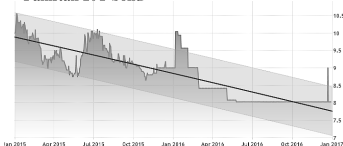
Pakistan 10Y bond